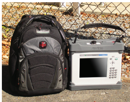
2. The battery-powered MW82119A PIM Master analyzers are small and lightweight enough to bring to the top of a cellular communications tower.

Characterizing a communications system and its cables and connectors for PIM requires multiple test signals at sufficient power levels. The MW82119A PIM Master