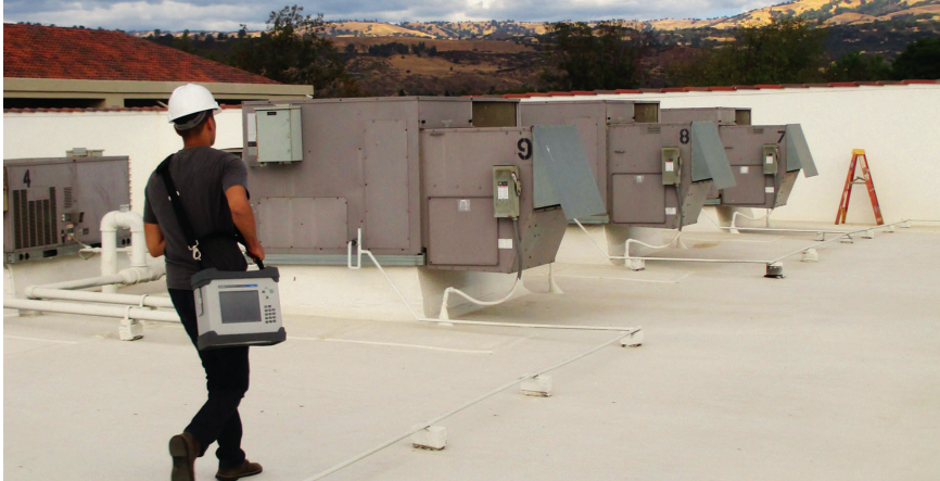
3. The MW82119A series of PIM Masters includes models for testing wireless frequency bands from 700 to 2100 MHz (see table).

Additional automated tests include PIM-versus-time and