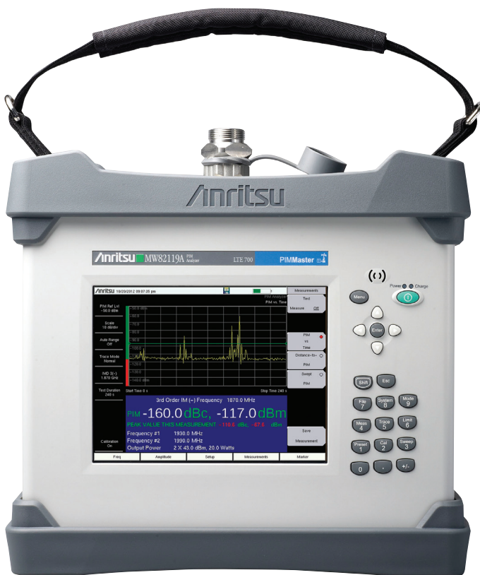
1. The MW82119A family of PIM Master portable instruments can locate PIM sources at cellular and other remote wireless communications sites.

The MW82119A line of PIM Master portable analyzers (Figs. 1-3) are small, battery-powered instruments with a highly visible, 8.4-in. (213-mm) touchscreen display for ease of use and visibility under a host of operating conditions. The product family includes different models for specific communications bands, such as 700 MHz for testing Fourth-Generation (4G) Long-Term-Evolution (LTE) cellular systems and 1900 MHz for checking PIM in Personal Communications