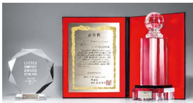
The trophies and award certificate of Corporate Value Improvement Award and Integrity Award

Corporate value improvement and integrity in operations are two wheels of management, and the recognition we have received is a big encouragement. That recognition is for things we have already done, however. We will not be satisfied with the progress we have made and will work to further strengthen our management.