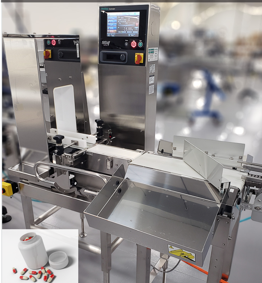
Example installation with vertical metal detector and dual flipper reject