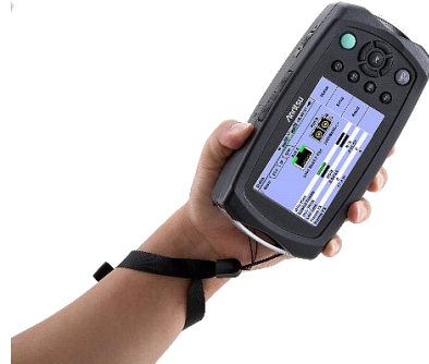
800 g (2 lbs.) Pocket Size Field Tester

Pushing start button completes all your testing requirements with TestAutomator .