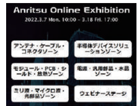
Anritsu Online Exhibition

Every year, we hold an event to showcase products manufactured by our suppliers and their technologies. We also provide an occasion for our engineers to share information with their counterparts at our suppliers. In fiscal 2021, as in the previous year, we held the Anritsu Online Exhibition online twice for a total of three weeks, with 45 suppliers in attendance. The exhibition featured 11 webinars on cutting-edge technologies, providing an opportunity to exchange opinions and information with our suppliers. In fiscal 2022, we plan to hold the exhibition both online and in person.