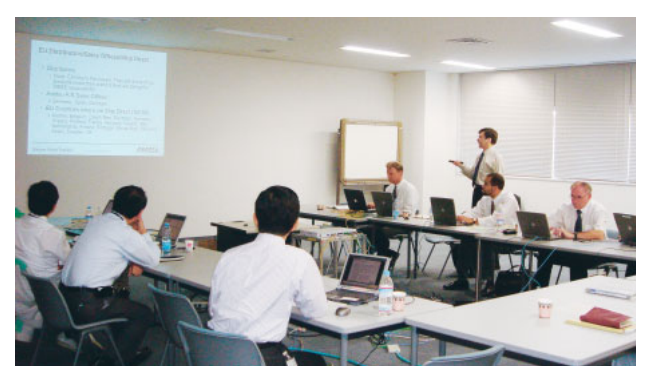
Global Environmental Management Meeting

In addition, we set up the Global WEEE<sup>15</sup> Meeting and Global RoHS<sup>16</sup> Meeting under the Global Environmental