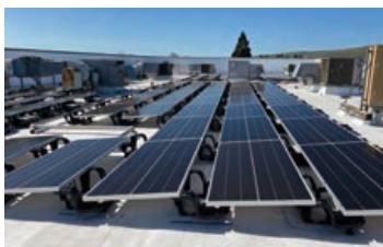
Solar power generation facility under construction at Morgan Hill

Target 7.2 in Goal 7 of the Sustainable Development Goals (SDGs) promotes increasing substantially the share of renewable energy in the global energy mix by 2030. PGRE 30 is Anritsu's own unique contribution to directly expanding the use of renewable energy by introducing the solar