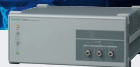
Wireless Connectivity Test Set MT8862A