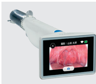
Wireless technology is essential in making this 'visual stethoscope' as useful as a physician's regular stethoscope.

diagnostic data on throat infections in a massive and shareable format, bringing new insights to medical researchers and fostering effective medical technology. Anritsu's wireless test evaluation technologies support these meaningful challenges and efforts.