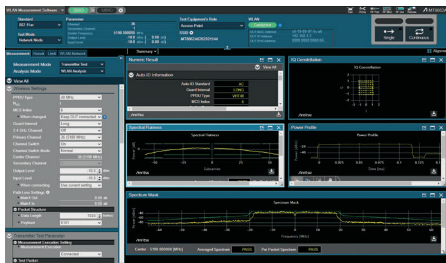
Example of Wi-Fi evaluation using Anritsu's MT8862A (Not actual nodoca™ evaluation data)

using evaluation boards and other equipment when selecting a commercial Wi-Fi module. We are going to ask Anritsu for support again next time."