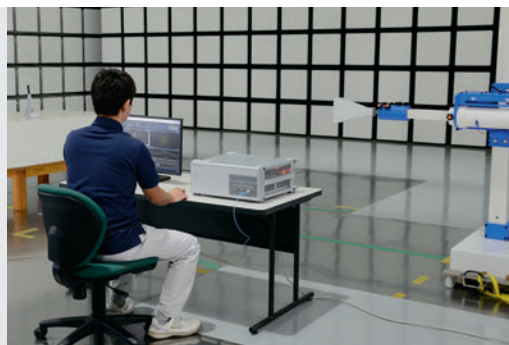
Evaluating prototypes in preparation for nodoca™ release

*1: Wi-Fi® and the Wi-Fi logomark are registered trademarks of Wi-Fi Alliance®