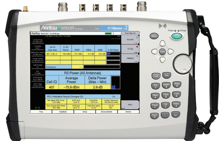
HANDHELD SIZE: 315 MM X 211 MM X 71 MM (12.4 IN X 8.3 IN X 3.0 IN), LIGHTWEIGHT: 4.6 KG (10.2 LBS)

BBU Emulation and RET Control for Nokia/ALu LTE (CPRI Only) PIM over CPRI Measurements