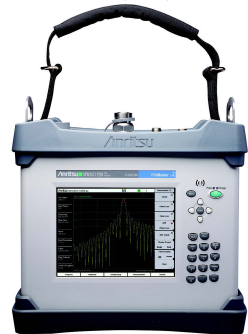
SIZE 350 MM X 152 MM (13.8 IN X 12.4 IN X 6.0 IN) LIGHTWEIGHT: 9.2 KG TO 12.4 KG (20 LB TO 27 LB), VARIES BY FREQUENCY OPTION