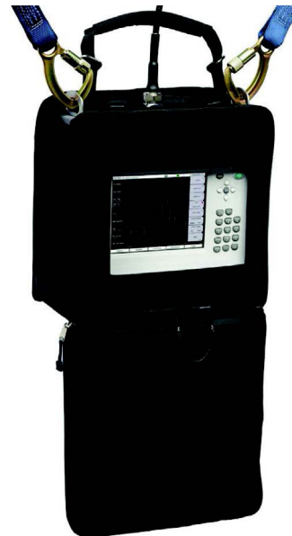
SOFT CASE OPENS IN FRONT FOR EASY ACCESS AND USE