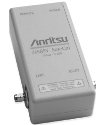
36585V Series AutoCal Module