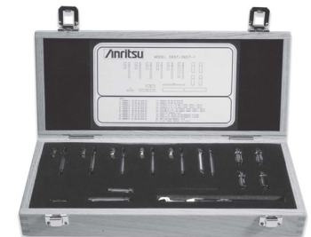
3657 Series V Cal Kit

For more information go to www.anritsu.com