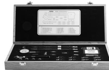
3654D Series Cal Kit