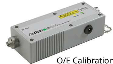
O/E Calibration Module MN4765B