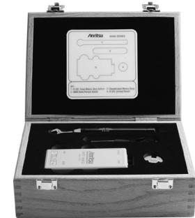
36585 Series Cal Kit