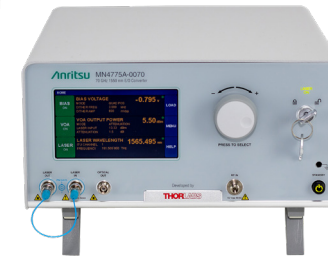
E/O Converter MN4775A