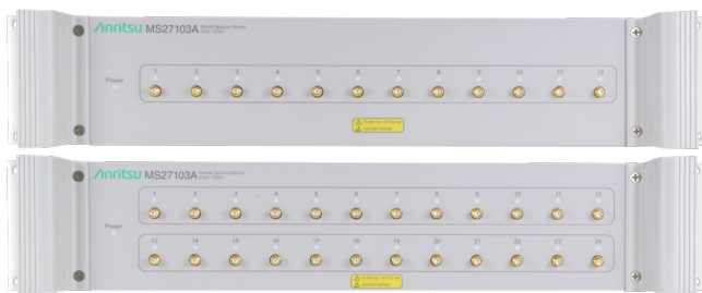
The Remote Spectrum Monitor MS27103A is housed in a rack-mountable enclosure with 12 (or optionally) 24 RF Inputs. An electronic switch is used to address each port. The Remote Spectrum Monitor MS27103A is a full featured platform for monitoring and recording signals at user specified frequencies.

The Remote Spectrum Monitor MS27103A allows users to monitor spectrum for interference signals which can cause slow data rates and dropped calls. Using algorithms such as power of arrival (POA) and time distance of arrival (TDOA), interference signals can be accurately positioned.