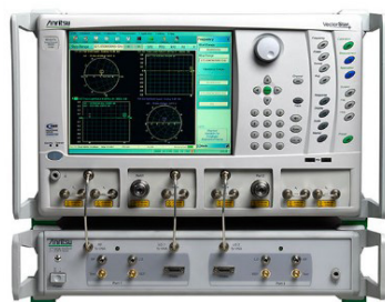
VectorStar VNA Family