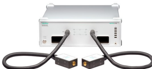
ShockLine E-Band VNA