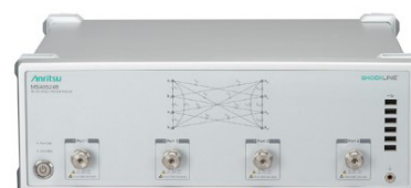
ShockLine VNA Family