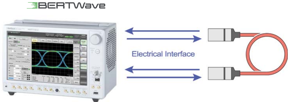
Active Optical Cable Evaluation