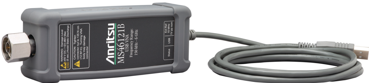
MS46121B ShockLine 1-Port USB VNA