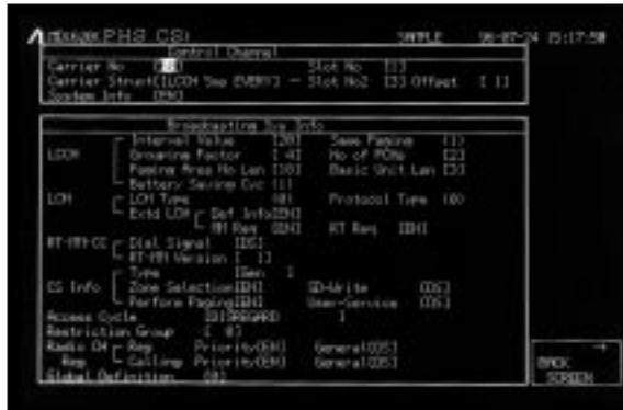
Control CH setting screen (CS simulation mode)

When being used as a CS simulator, a control CH and broad casting information that the MD1620C sends can be set at the control CH setting screen and communications CH can be set at the communication CH screen. Handover test during communications can be performed by alternatively changing a communication CH 1 and a communication CH 2.