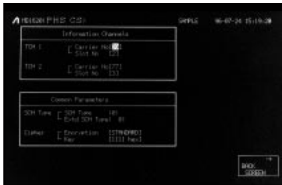
Communication CH setting screen (CS simulation mode)