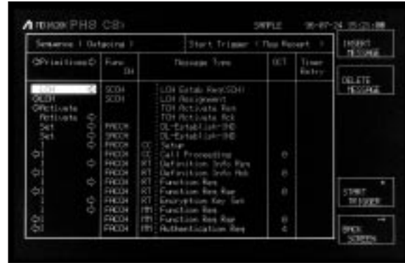
Sequence setting screen (CS simulation mode: origination sequence)

And by defining arbitrary sequences in Option 01 and Option 02, sequence tests for supplement service and semi-normal sequence can be done.