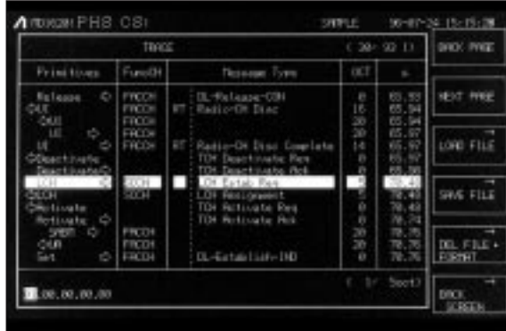
Trace screen (CS simulation mode)

By using the trace function, up-link and down-link control signals sent or received by PS or CS during a sequence test are stored in built-in memories and are displayed after the sequence test ends. Max. 100 steps back from the test end are displayed in layer 2 and layer 3 levels and with elapsed time in 10 ms steps. This function allows engineers to find out the cause (s) when errors occurred during the sequence test and is indispensable to software debug and tests.