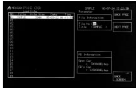
File management screen

Parameters and test sequences defined can be stored as a file on a floppy disk and up to 100 files can be stored. Trace data gotten by using the trace function can be also stored on a floppy disk.