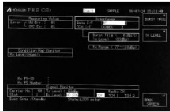
Execution condition monitor screen (CS simulation mode)