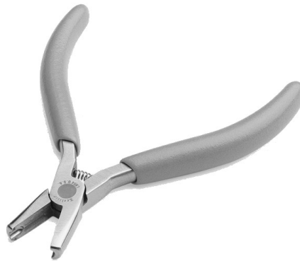
Figure 2. 01-501 Insertion and Removal Tool